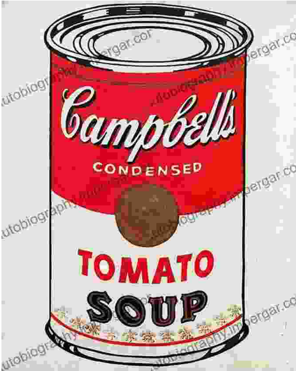
Andy Warhol, Campbell's Soup Cans , 1962. Silkscreen ink on canvas. Museum of Modern Art, New York.

Pop artists, such as Andy Warhol and Roy Lichtenstein, drew inspiration from Freud's ideas on the role of unconscious processes in shaping our desires and behaviors. Their works often juxtaposed familiar consumer goods and mass-produced images with elements of the unconscious,