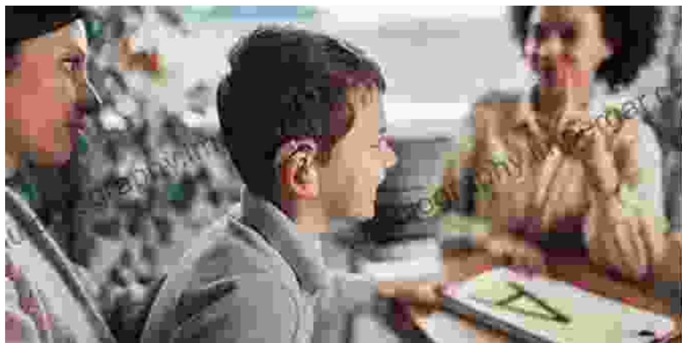
Early Intervention for Deaf and Hard-of-Hearing Infants, Toddlers, and Their Families: Interdisciplinary