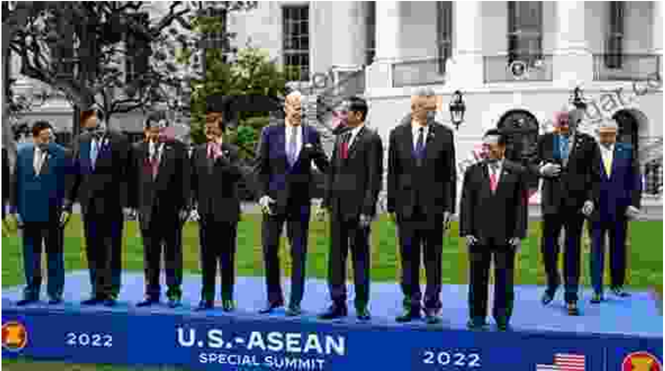
Asian leaders at a summit

Moving beyond the Cold War, this chapter examines the enduring rivalries and competition within Asia. It analyzes territorial disputes, resource conflicts, and the rise of China as a major regional power. The book explores how these factors have shaped regional security dynamics and the balance of power.