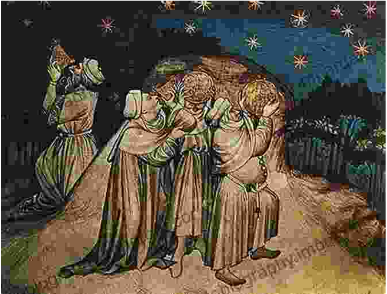
Babylonian astrologers charting astronomical events